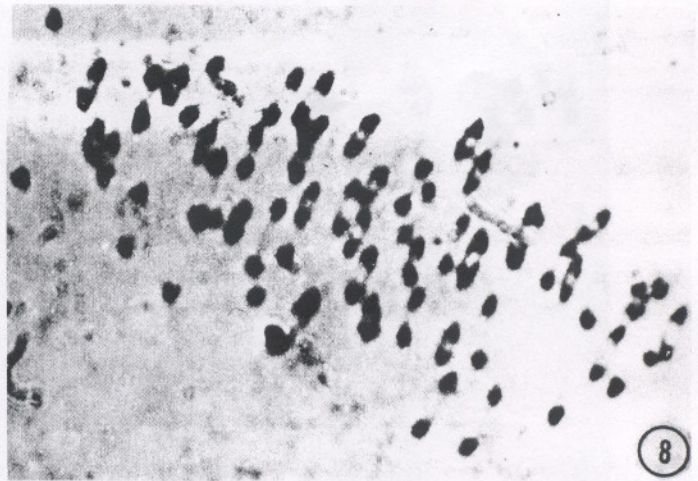
Fig. 8. F23 hybrid: early anaphase I

showed bivalents in Metaphase I (Fig. 7) and their segregation during Anaphase I was found to be normal (Fig. 8).